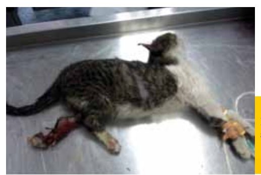
Fig 2. Cerebellum disconnection in a cat – decerebellate rigidity.