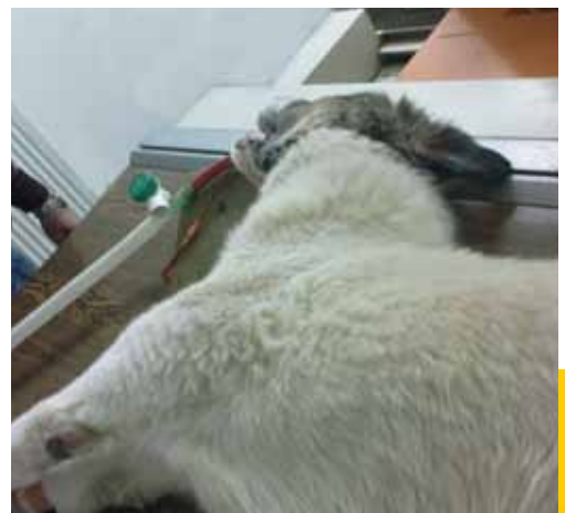
Fig 1. Decerebrate rigidity in a dog. Tracheal tube is in place.

Imaging of the skull is commonly indicated, especially in animals which do not respond or deteriorate despite their initial improvement after aggressive treatment. Plain radiographs are not particularly useful but they may reveal skull fractures. Computed tomography (CT) is preferred over magnetic resonance imaging (MRI) at the beginning of the imaging study because it provides faster and better imaging of both the bones and the location and extent of the hemorrhage. In contrast, MRI is more useful when it is performed after the initial stabilization of the animal, because it assists on the determination of prognosis for the rehabilitation of the animal. It is noted that MRI is more expensive imaging modality compared to CT.5,24