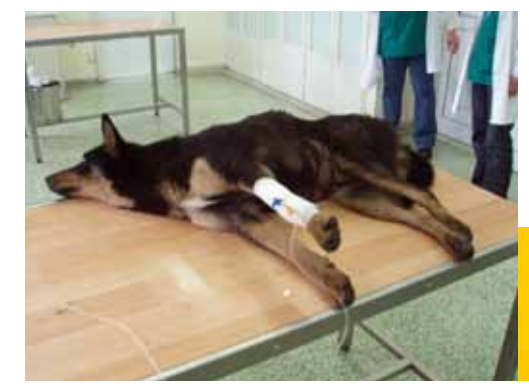
Fig 3. Schiff – Sherrington syndrome in a dog.